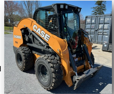
New Skid Steer

2024 is going to be a year of progress for major project completions. Recently, a $315,000 grant was awarded to Mohnton borough which will be used to repair a Stormwater Channel/Stabilization issue. It will renovate/improve a major erosion problem within the borough. Additionally, a large bid package has been submitted for extensive roadwork improvements. Weather worn streets will be repaired throughout the borough. If you see the white lines around potholes or rough roadways, these are areas marked for the bid.